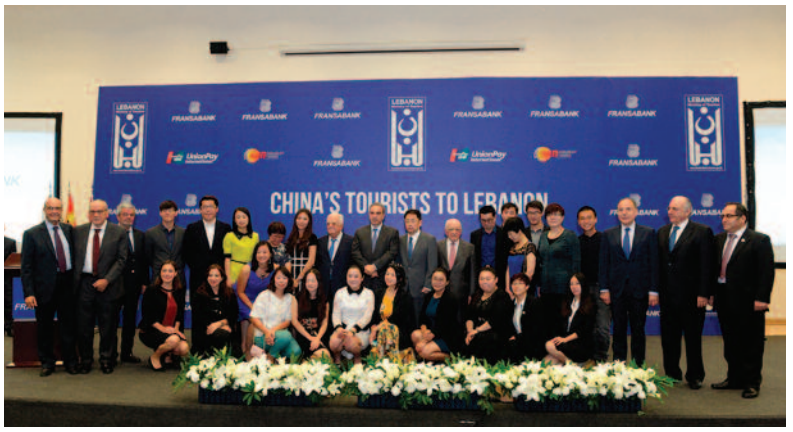
Chinese Delegation with the speakers