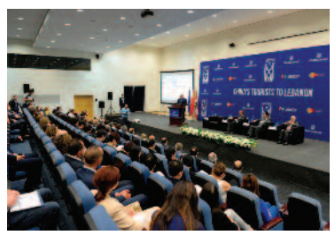
Overview of the Press Conference