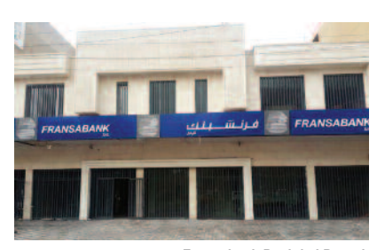
Fransabank Baghdad Branch

The Forum was held with the participation of the Governor of the Iraqi Central Bank and a group of Iraqi, Lebanese and Arab bankers in addition to heads of Heads of banking and financial institutions, experts, economists and representatives of specialized media outlets.